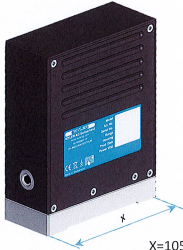
X=105, 150 or 200 mm

WYLER AG declares hereby under the sole responsibility that the product